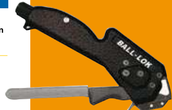
K50289 Ball-Lok Tool Adjustable tension, forms lock, cuts off tail.