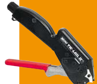
A91079 Mini Tie-Lok® II Tool Adjustable tension, forms lock, cuts off tail.