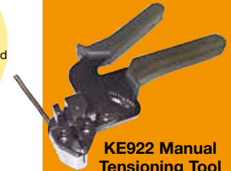
KE922 Manual Tensioning Tool with tail cut-off lever.