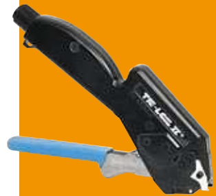
A92079 Tie-Lok® II Tool Adjustable tension, forms lock, cuts off tail.