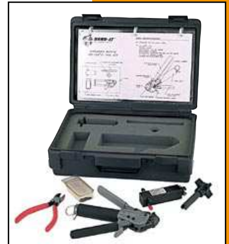
A49099 Tie-Dex® II Kit

Weight: 4.6 Lbs (2.0 Kg). Kit includes: 1-A30199, 1-A47599, 1-A44699, parts and cutters.