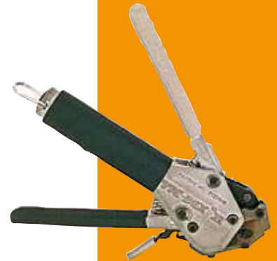
A40199 Tie-Dex® II Tool

Precalibrated tool applies Tie-Dex® Micro Bands. Weight: 1.3 Lbs (0.6 Kg). Use the Calibration Key (A44699) to change calibration.