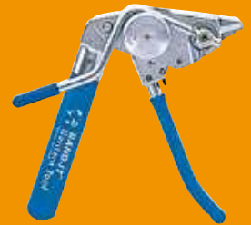
C07569 Bantam Tool