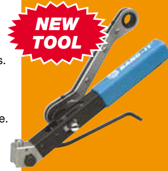
TL3800 Tie-Lok® Tool New for 3/8" Tie-Lok® only