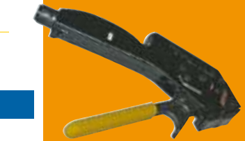
M50389 Multi-Lok Hand Tool Adjustable tension, forms lock, cuts off tail.