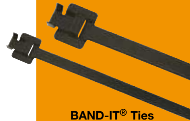
BAND-IT® Ties PPA571 coated