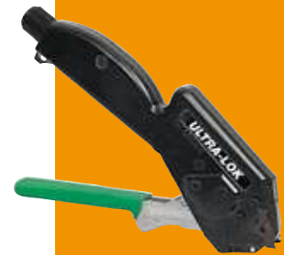
A94099 Ultra-Lok® Tool Adjustable tension, forms lock, cuts off tail.