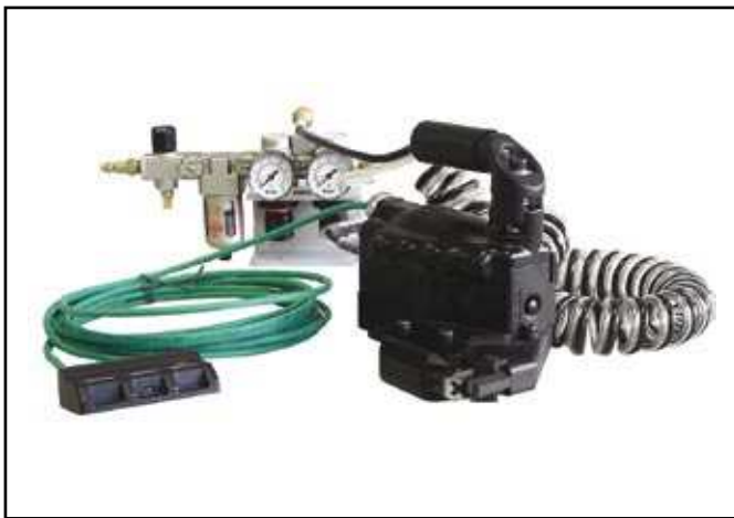
IT Series Tools