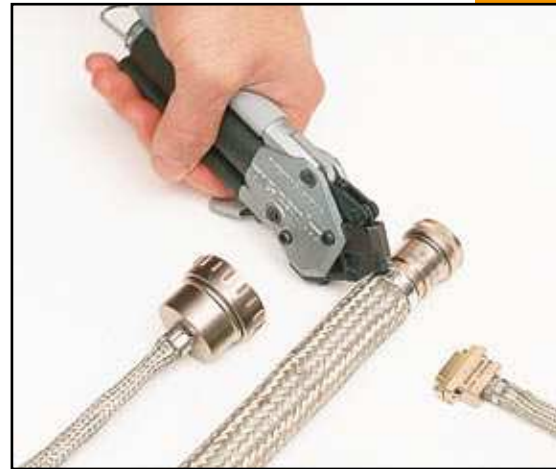
A40199 Tie-Dex® II Tool