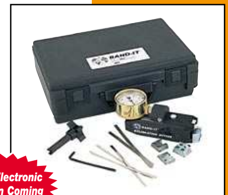
A50099 Tie-Dex® Calibration Kit

50 test bands. Weight: 0.1 Lbs (0.06 Kg).