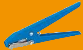
AE2009 Cable Tie Tensioner