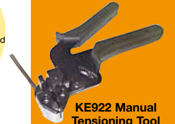
KE922 Manual Tensioning Tool with tail cut-off lever.