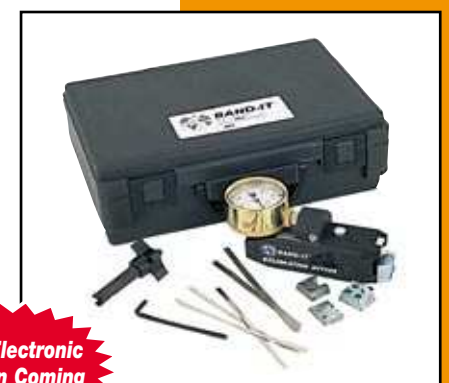
A50099 Tie-Dex® Calibration Kit

50 test bands. Weight: 0.1 Lbs (0.06 Kg).