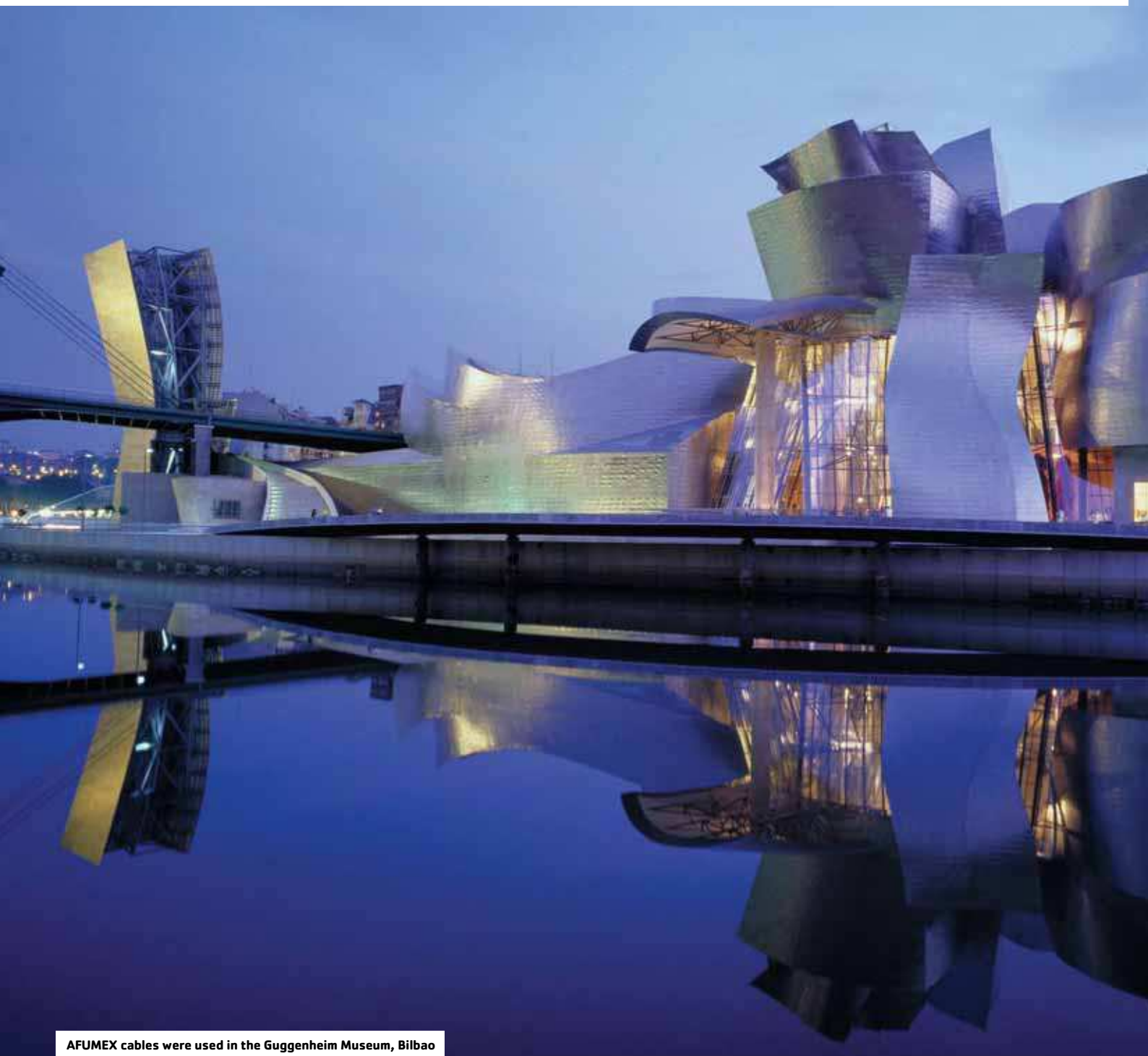
AFUMEX cables were used in the Guggenheim Museum, Bilbao