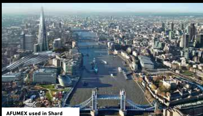
AFUMEX used in Shard