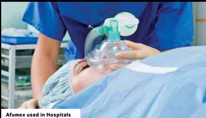
Afumex used in Hospitals