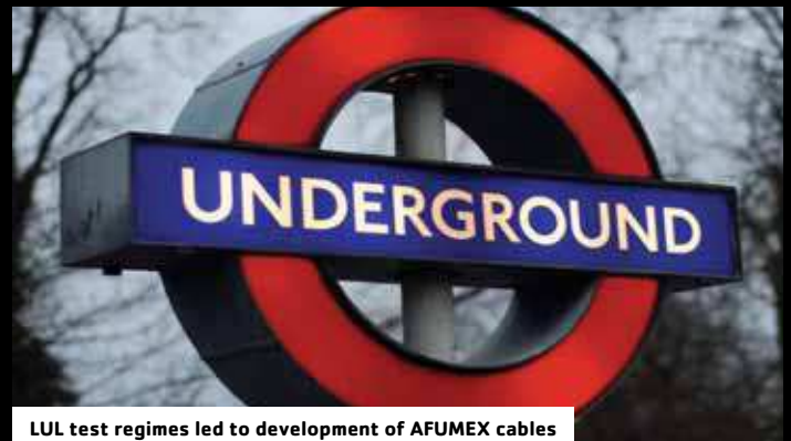
LUL test regimes led to development of AFUMEX cables