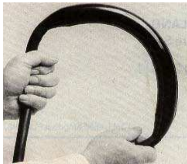
Excellent flexibility in completed joint.