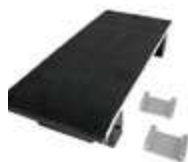
ComPlus frame mid section