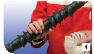
Once the inner core has been fully removed, the termination installation is complete!