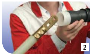
Place the 3M™ Cold Shrink termination body over the cable end and position at the correct point on the cable