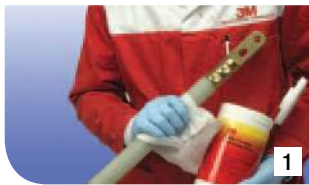
Prepare the cable as normal and clean with 3M™ Cable Wipes