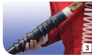
Begin to remove the inner core, allowing the termination to shrink down onto the cable