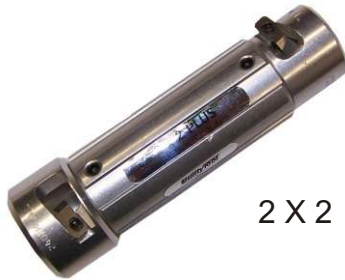
2 X 2

Note: This tool is designed to strip 45 Mil to 110 Mil XLPE and EPR insulations. Insure that the proper cutting head (bushing) has been selected for the wire you are using. Both tools use the same bushings.