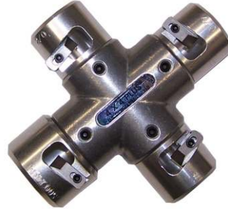
4 X 4