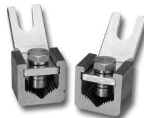
Spare terminal assembly kit (54614-18)