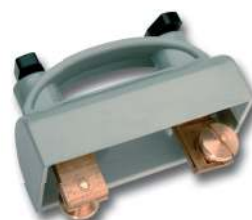
Spare fuse carrier (58424-06)