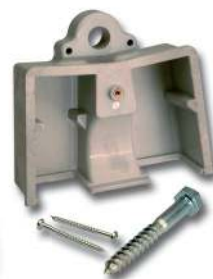
Coach screw (supplied) or No 8 wood screw fixing options