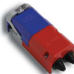
Low Force Lever Release model

An armour bond kit is available, comprising: - clamp, ferrules, lead-strips and fixing screws. Suitable for loop in/out cables.