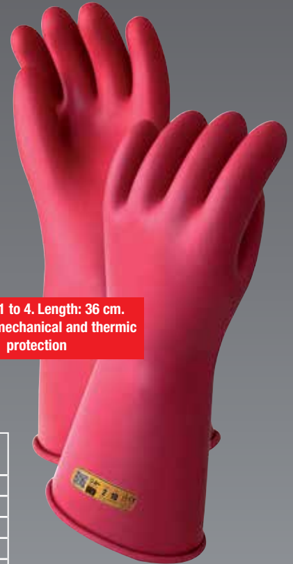
Classes 1 to 4. Length: 36 cm. WITHOUT mechanical and thermic protection

CATU also performs your periodic maintenance.