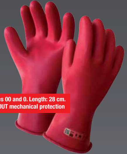
Classes 00 and 0. Length: 28 cm. WITHOUT mechanical protection