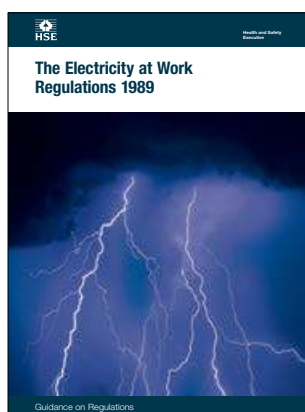
HSR25 (Third edition) Published 2015

This new edition of HSR25 will help dutyholders meet the requirements of the Electricity at Work Regulations 1989. It will be of interest and practical help to all dutyholders, particularly engineers (including those involved in the design, construction, operation or maintenance of electrical systems), technicians and their managers.