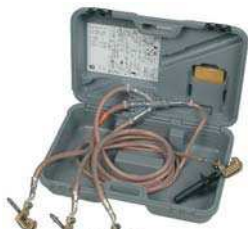
Plastic case. M-78665