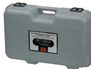
Plastic case included. M-78665