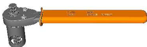
'JTS/7I' Universal Screw Ratchet Tool (Insulated)

The appropriate tooling is to be used at all times, typical examples shown below.