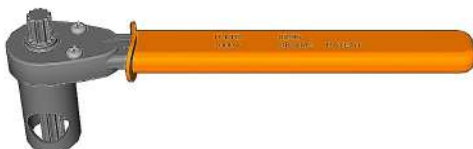
'JTS/7I' Universal Screw Ratchet Tool (Insulated)

The appropriate tooling is to be used at all times (Ref: HVTM3/4), typical examples shown below.