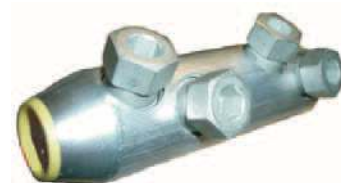
SPS Joint has tapered Profile with Conductors Centralised

Notes: Items 1-3 are the Universal type, items 4-12 have only the required modules. Trifurcating Joints are available.