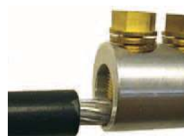
Non Centralised Type Connectors