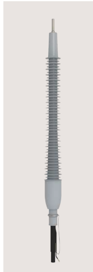
ESF 52 - 170 kV