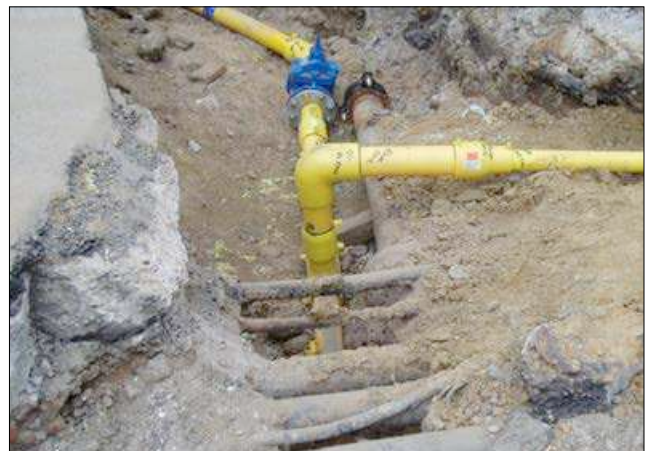
Figure 6 Congested services

89 Occasionally, cables are terminated in the ground by means of a seal, sometimes with external mechanical protection. These 'pot-ended' or 'bottle-ended' cables should be treated as live and should not be assumed to be abandoned or disused. They can be difficult to detect with locators even when 'live'.