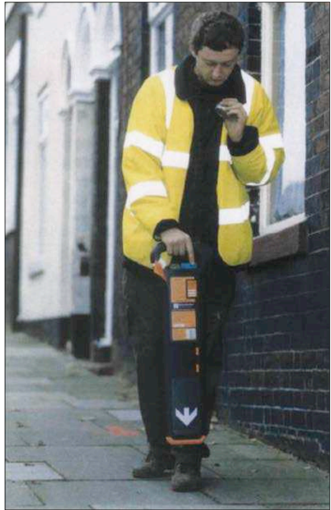
Figure 5 Using a cable locator