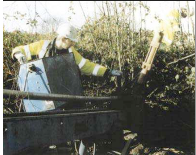
Figure 8 Horizontal drilling being used for laying a cable under a road

170 However, clearances for any technique may need to be varied, taking into account such factors as the construction of adjacent plant, ground conditions, bore diameter, the accuracy and reliability of the technique/equipment being used and whether the other plant is parallel to or crosses the proposed line. You should take into account any requirements of the owners of adjacent services.