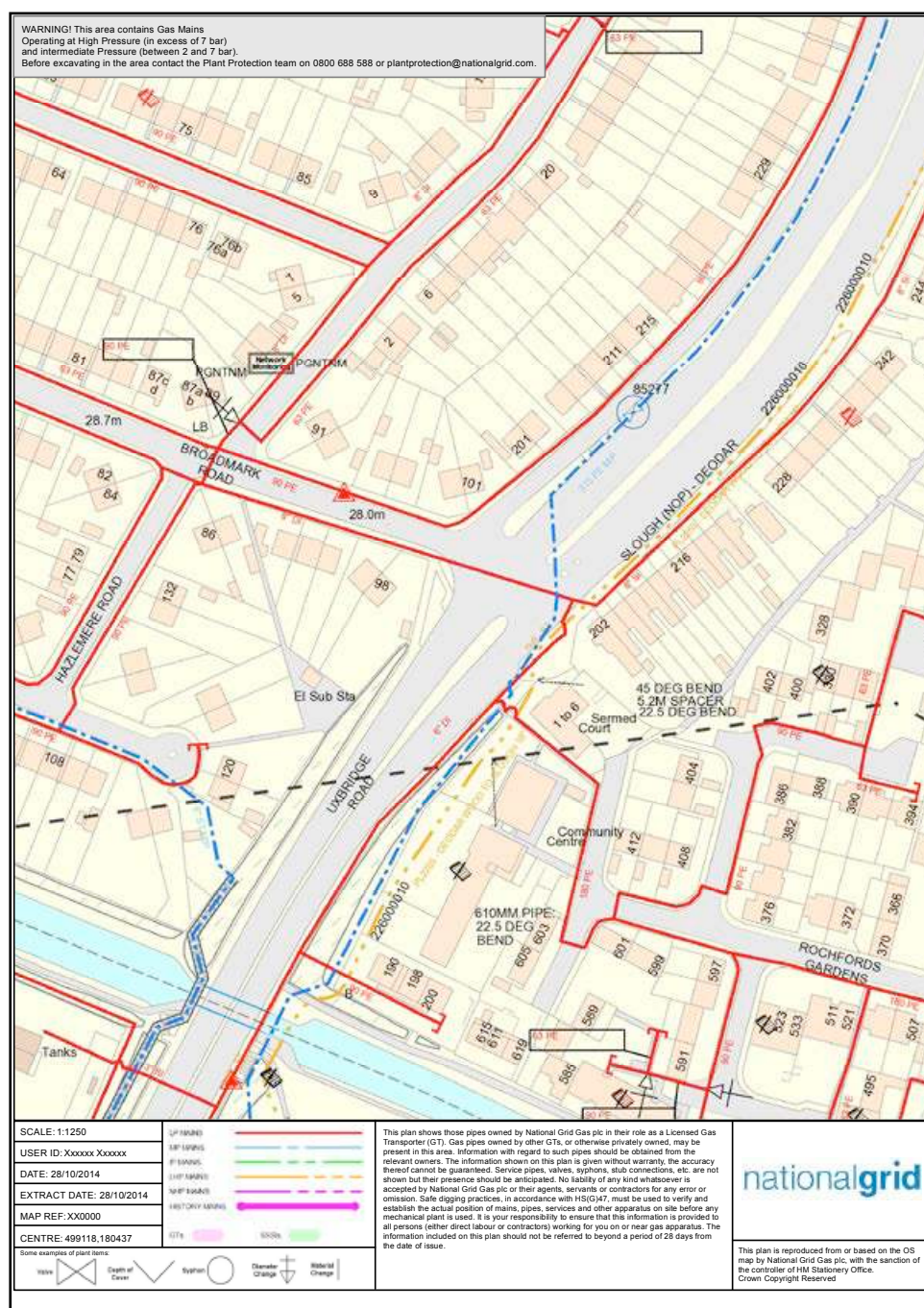
Figure 4 Example of a plan of gas pipes

43 The service location information should be copied onto the working drawings for the guidance of those carrying out the work. Information should include all relevant features, such as valve pits, depths etc. Take particular care where topographical changes have occurred since services were laid.