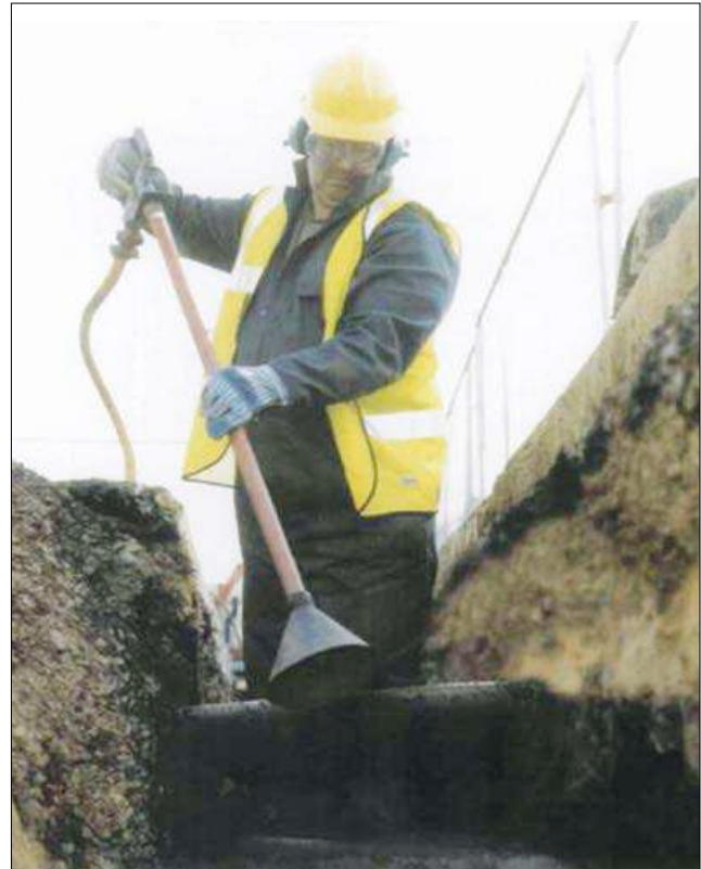
Figure 7 Using an air digging tool

111 Safe methods of excavating may include vacuum excavation, which may incorporate use of water jetting and high-velocity air jets. They can be very effective in congested excavations where mechanical excavation and use of hand tools is difficult. However, they have limitations and will not work on all ground conditions or materials such as concrete.