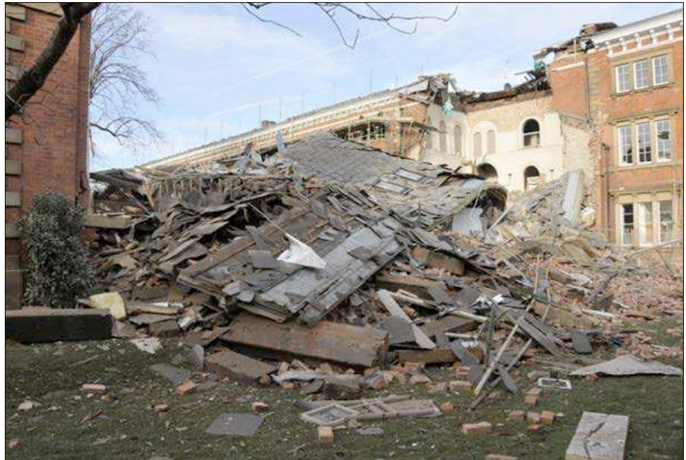
Figure 1 Aftermath of a gas explosion, following damage to an underground gas service pipe