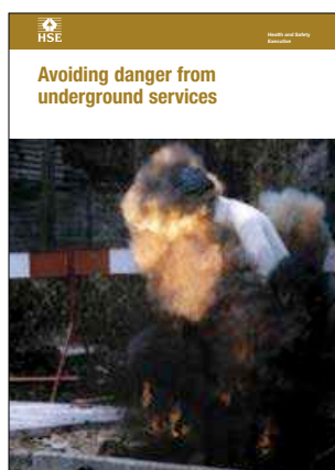
HSG47 (Third edition), Published 2014

This guidance is aimed at all those involved in commissioning, planning, managing and carrying out work on or near underground services. It will also be of use to the owners and operators of such services.