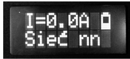
Pic.4 Work in low voltage mode – value of current measured with the clamp and battery level can be seen on the screen.