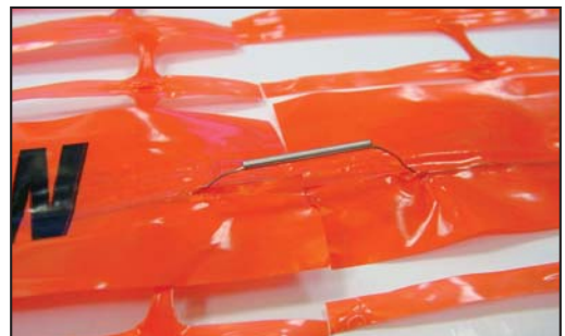
Connection of the mesh using the crimps. If the mesh wire is not installed correctly then the signal may not pass from join to join.