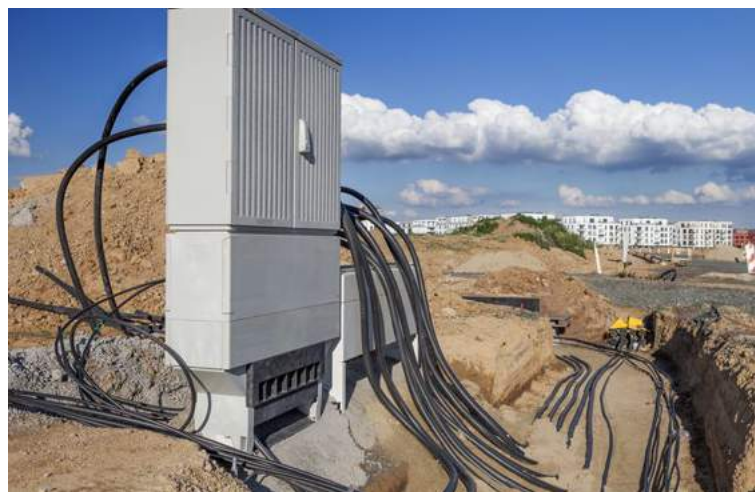
Always the right connector: Large ranges ensure high flexibility at the construction site.

SICON connectors can be used independently of the conductor material, type, voltage level and current. No matter whether aluminum or copper, solid or stranded – the conductor is always connected with perfect contact pressure. For aluminum conductors, this means with a contact force up to 30% higher than of conventional connectors. The transverse grooves in the clamping channel break through the oxidation layers and reliably establish the contact.