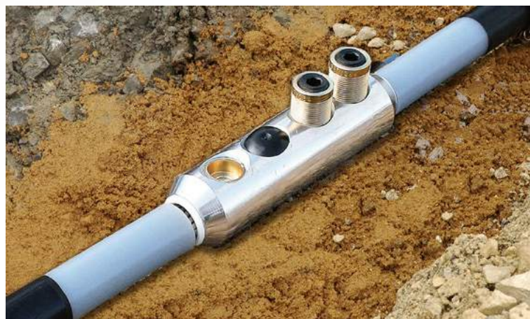
Always the right choice: SICON combines all conductor designs and materials safely and reliably.