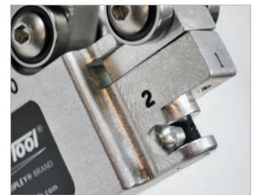
Equipped with four speed positions to optimize performance.