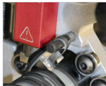
Winding pin keeps semi-con strip from getting in the way.