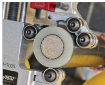
Extra rollers provide tool stability on a range of cable sizes.