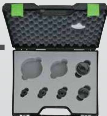
Slug Buster® punch set ISO 16/20/25/32/40 & 22.5