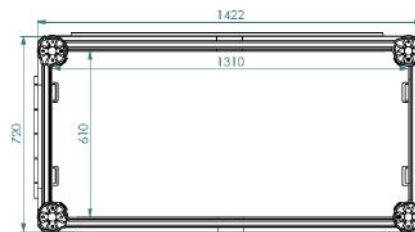
Fortress cross-section top view