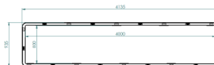
ULTIMA Connect cross-section top view