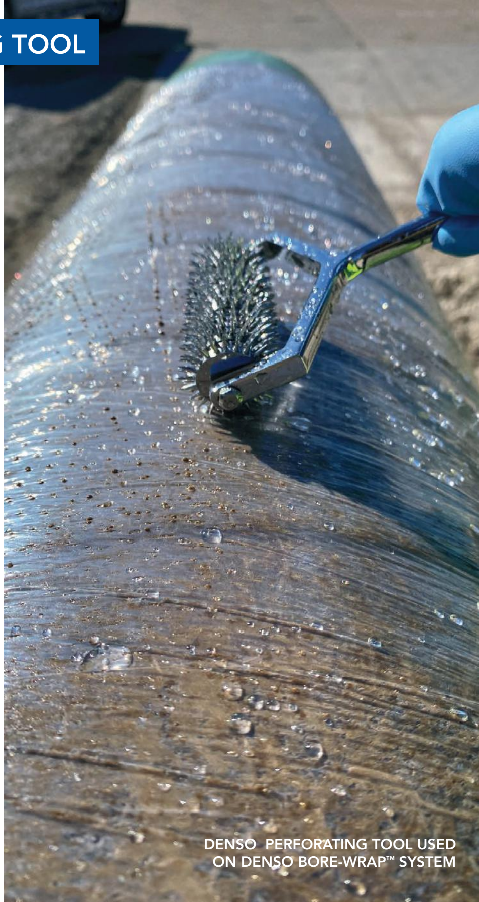
DENSO PERFORATING TOOL USED ON DENSO BORE-WRAP™ SYSTEM