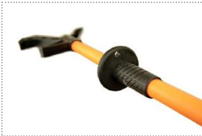
Hand Guard with Tethering Point

Passed third-party high voltage ASTM F3121 Section 6.3 75 kV/ft. 60Hz test