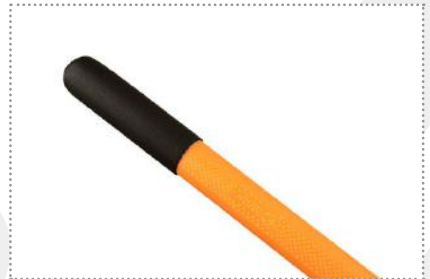
Rubber End Grip