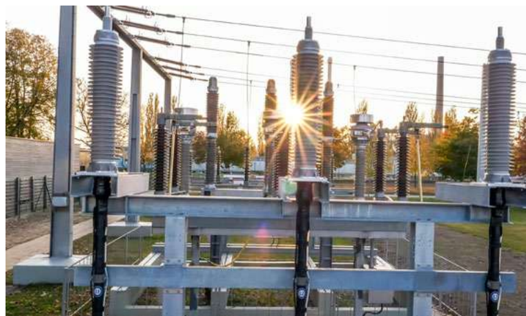
Fast and safe installation, with environmentally friendly technology.