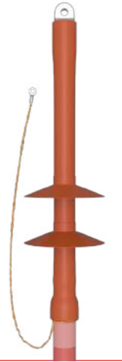
Type tested acc. Cenelec HD 629.1 IEC 60502-4

Each "MONOe" termination kit contains material to allow for 3 phase installation.