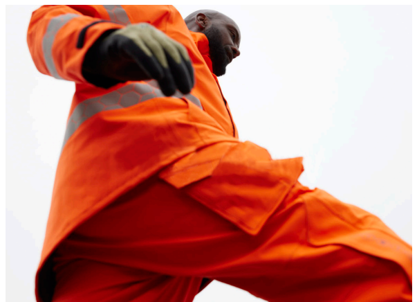
Added stretch for movement and kneeling