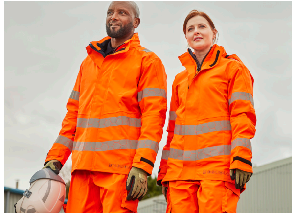
Ultra lightweight and breathable