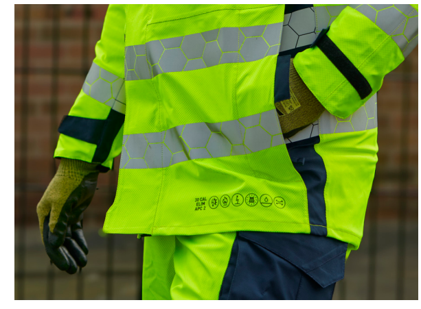
Clear printed SafetyICON™