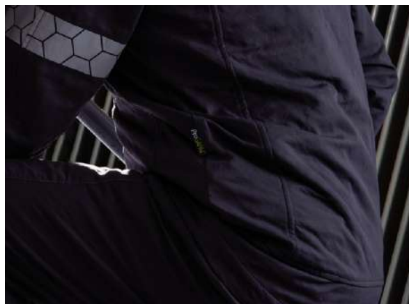
More comfortable during high-intensity activities