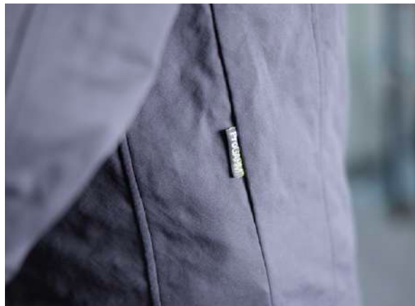
Lightweight GORE-TEX® fabric technology