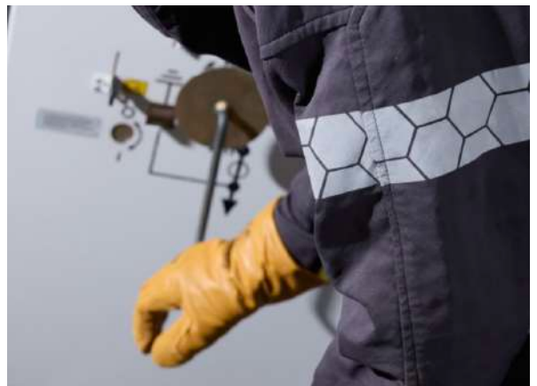
Increased ease of motion with less muscular fatigue