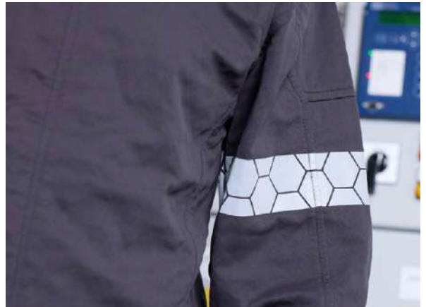
Lightweight GORE-TEX® fabric technology