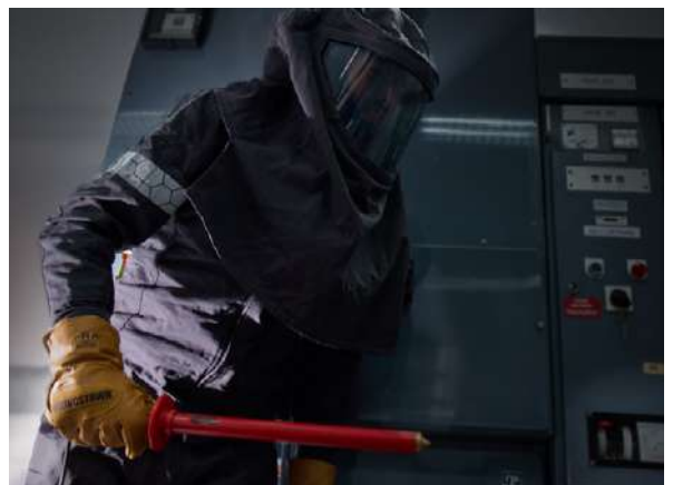
More comfortable during high-intensity activities